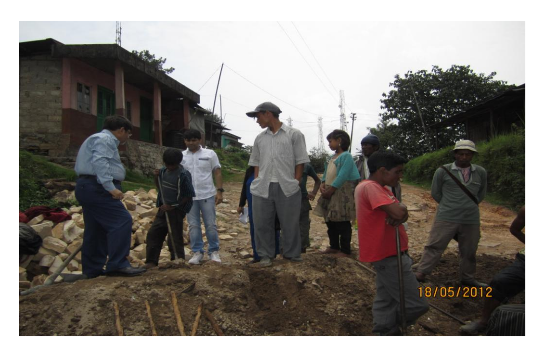
Visit Report By:

Also Visit of NCPCR Team to the Health Centre and Anganwadi Centre in Jaintia Hills and the Children Home-cum Observation Home for Girls in Shillong (from 17<sup>th</sup> to 20<sup>th</sup> May 2012)